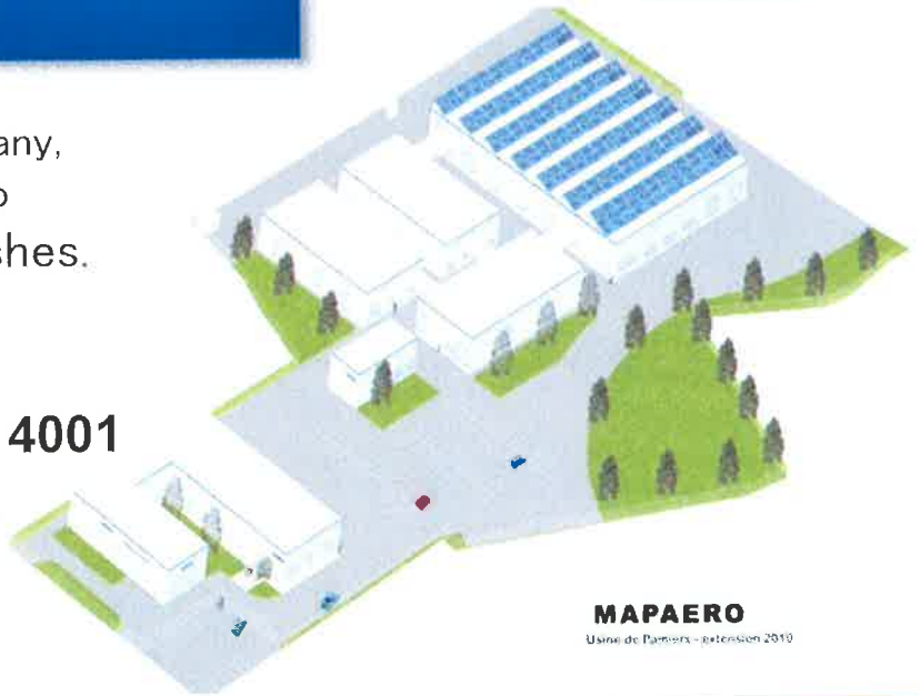
MAPAERO Usine de Paimpox - extension 2010